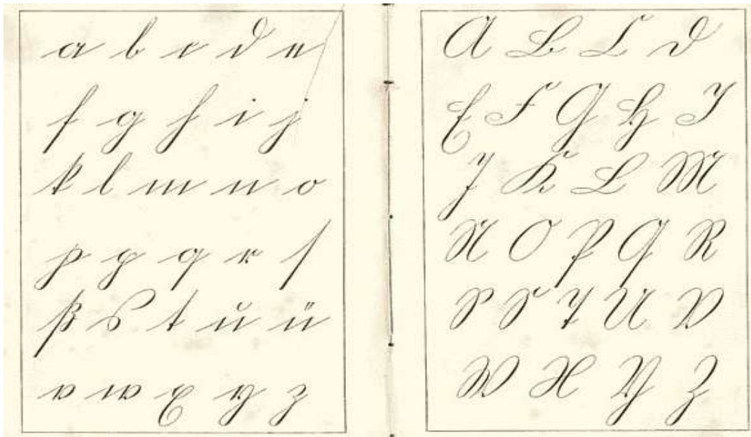
Kurrent (around 1900)

The following is a comparison of three scripts where you can quickly identify parallels.